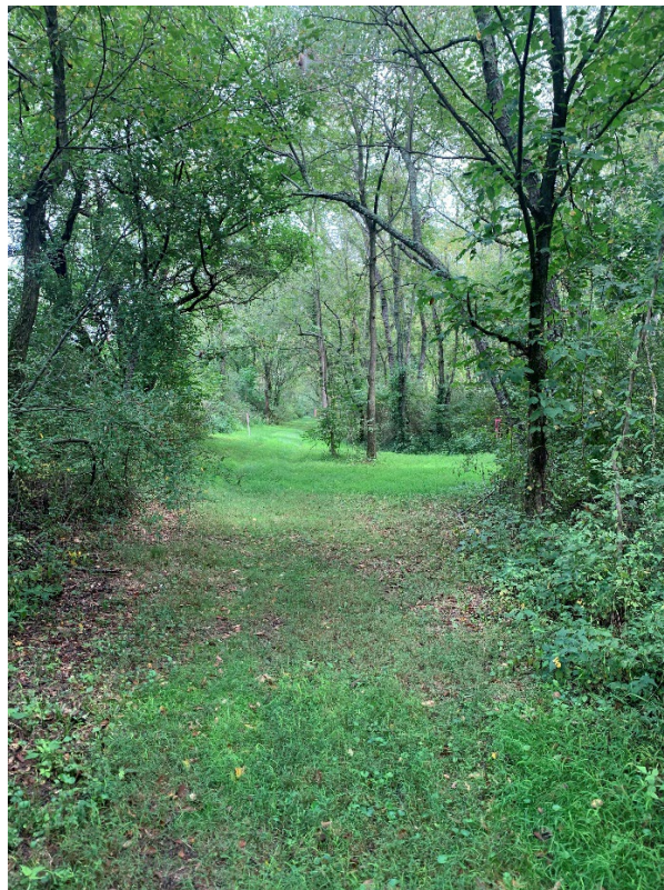
Prodigy disc golf baskets and concrete tee pad examples